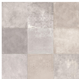
BABILONIA LAPPATO DECOR 60X60 B54