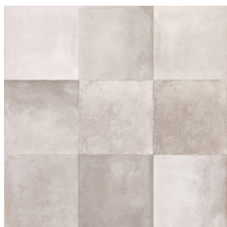
BABILONIA LAPPATO 60X60 B51