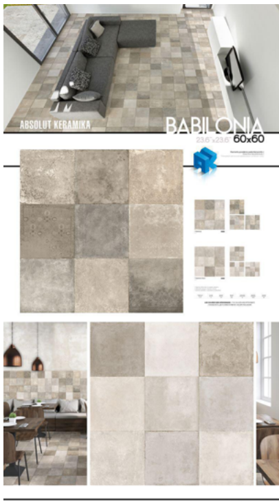
PT BABILONIA 60X60 (100.5x192.5)