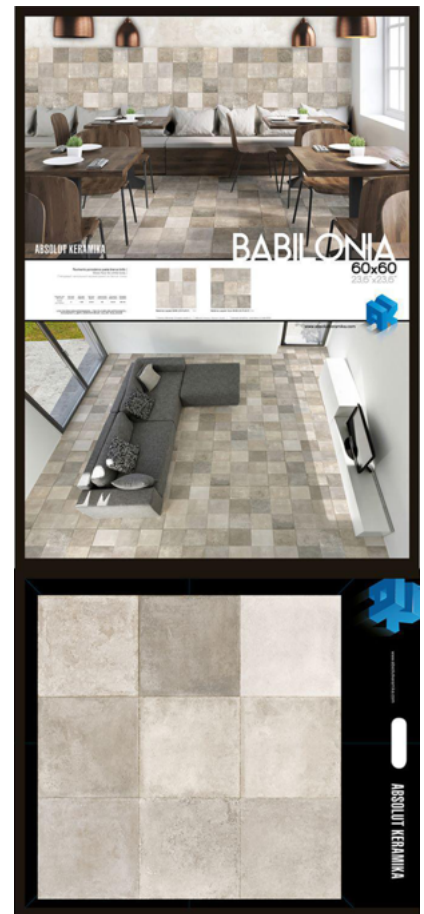
PE BABILONIA 60X60 (80X180)