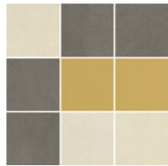
STRATUS 9 LOCUS MIX OCRE (a) (f) Bases: Locus Bone + Locus Gris + Cromática Ocre 30x30 SILK [29,5x29,5x0,85 cm] P19/peça_pieza [1m 2 = 11 peças_pieces]