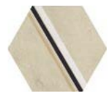
HEXA FLOW BONE (b) (f) 16,5x19x0,85cm SOFT GRIP P15/peça_pieza [1m 2 = 41 peças_pieces]