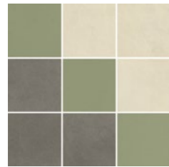
STRATUS 9 LOCUS MIX OLIVA (a) (f) Bases: Locus Bone + Locus Gris + Cromática Oliva 30x30 SILK [29,5x29,5x0,85 cm] P19/peça_pieza [1m 2 = 11 peças_pieces]