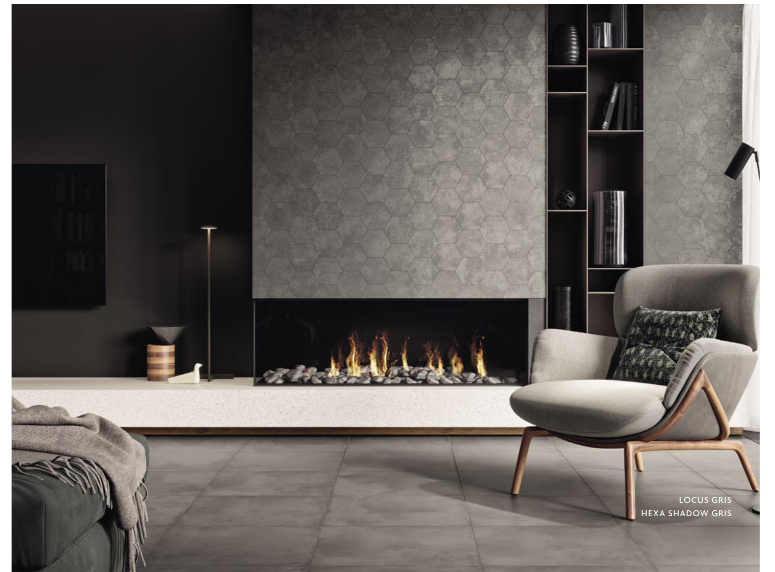
LOCUS GRIS HEXA SHADOW GRIS

(b) Existem 9 peças diferentes, de acordo com o desenho do decorado, que devem ser aplicadas alternadamente, de modo a obter-se uma solução mais rica e variada. (b) There are 9 pieces, matching the design of the decorated tiles, which should be applied alternately in order to obtain a richer and more varied decoration. (b) Différentes 9 pièces correspondent au dessin du décor. Il convient de les appliquer de façon alternée pour obtenir une disposition plus riche et plus variée. (b) Existen 9 piezas diferentes, de acuerdo con el diseño del decorado, que deben aplicarse de forma alterna, con el fin de obtener una solución más y variada. (c) Existem 18 peças diferentes, de acordo com o desenho do decorado, que devem ser aplicadas alternadamente, de modo a obter-se uma solução mais rica e variada. (c) There are 18 pieces, matching the design of the decorated tiles, which should be applied alternately in order to obtain a richer and more varied decoration. (c) Différentes 18 pièces correspondent au dessin du décor. Il convient de les appliquer de façon alternée pour obtenir une disposition plus riche et plus variée. (c) Existen 18 piezas diferentes, de acuerdo con el diseño del decorado, que deben aplicarse de forma alterna, con el fin de obtener una solución más y variada.