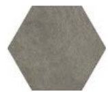
HEXA SHADOW GRIS (c) (f) 16,5x19x0,85cm SOFT GRIP P14/peça_pieza [1m 2 = 41 peças_pieces]