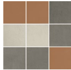
STRATUS 9 LOCUS MIX BRICK (a) (f) Bases: Locus Alloy + Locus Gris + Cromática Brick 30x30 SILK [29,5x29,5x0,85 cm] P19/peça_pieza [1m 2 = 11 peças_pieces]