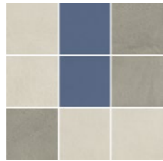
STRATUS 9 LOCUS MIX COBALTO (a) (f) Bases: Locus Alloy + Locus Smog + Cromática Cobalto 30x30 SILK [29,5x29,5x0,85 cm] P19/peça_pieza [1m 2 = 11 peças_pieces]